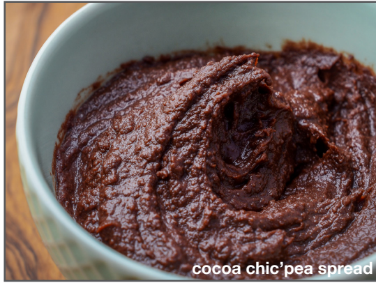
cocoa chic'pea spread